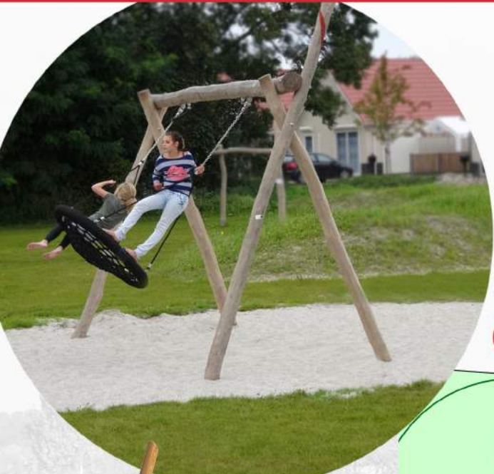
B ROB04.03.04 robinia vogelnestschommel