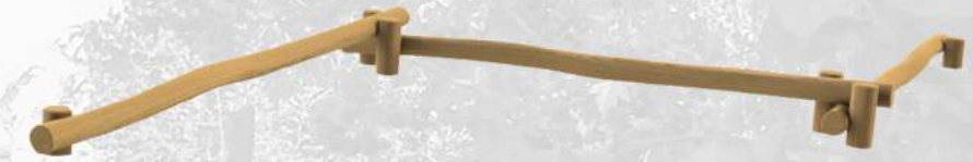
C ROB04.06.03 robinia driedelige evenwichtsbalken