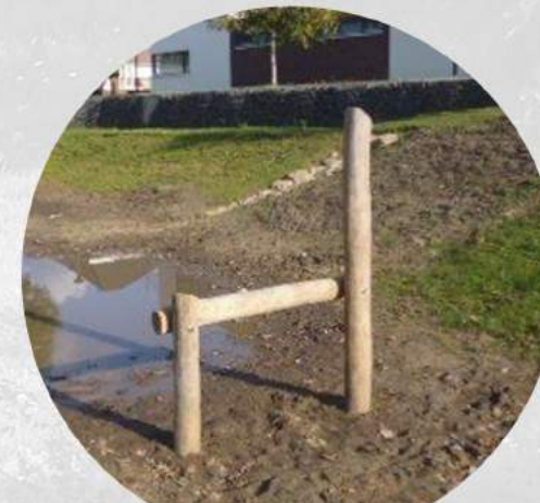
A ROB08.01.03 robinia minidoelen