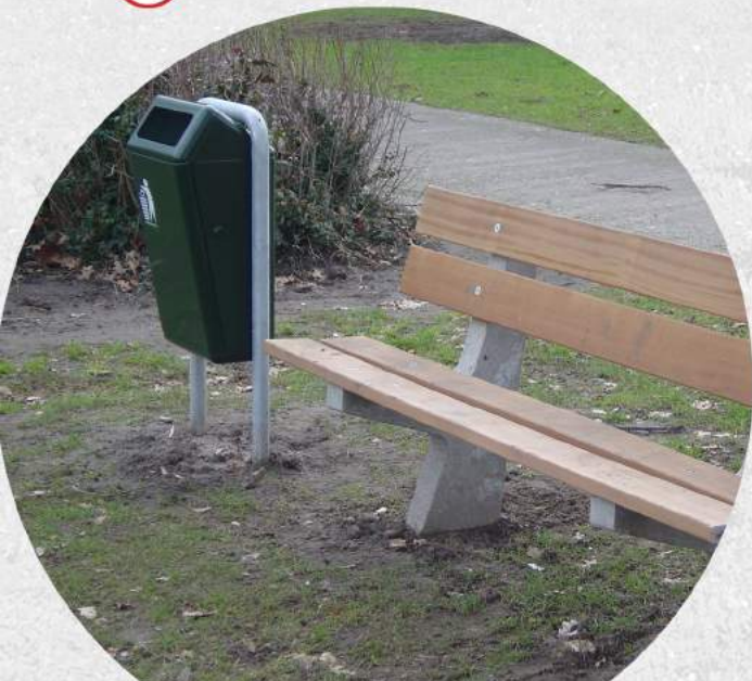
E 8.600 zitbank